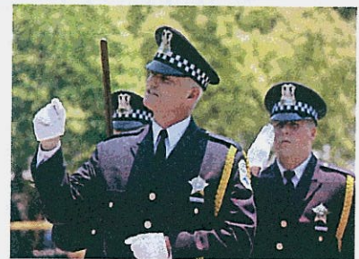
Photos of CPD in Honor Guard Competition and rigid inspection by U.S. Army Honor Guard (2010)