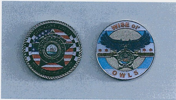
(Shown smaller. Actual size 1 3/4" diameter)

These O fficers W ithout L egal S tatus are hereby recognized with this coin. Presentation or possession of this coin is an honor in itself, serving as a tribute to the memory of those that have Served With Honor .