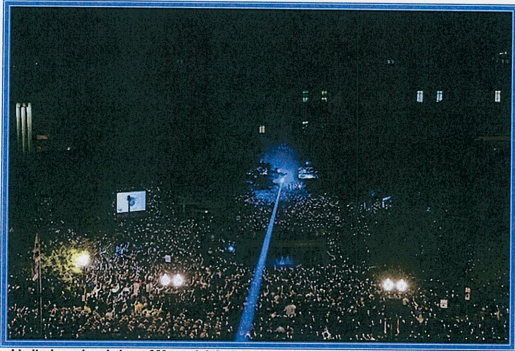
Limited overhead view of Memorial during Candle Light Vigil with app. 20,000 attendees

The 24th Annual Candlelight Vigil will be held at the National Law Enforcement Officers Memorial on Sunday, 13 May 2012 in Judiciary Square*, between 4 th and 5 th Sts., NW